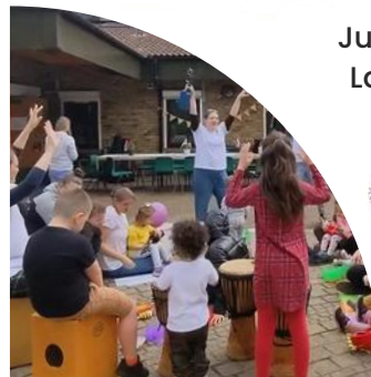
Jubilee Tea Party Langthorne Park Amphitheatre

Soundcastle worked in partnership with Peabody, Walthamstow Toy Library and Waltham Forest council to utilise local civic spaces to bring the Musical Beacons experience to the wider public.