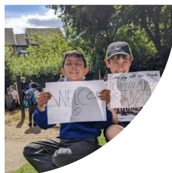
Mayville Primary School Summer Fair